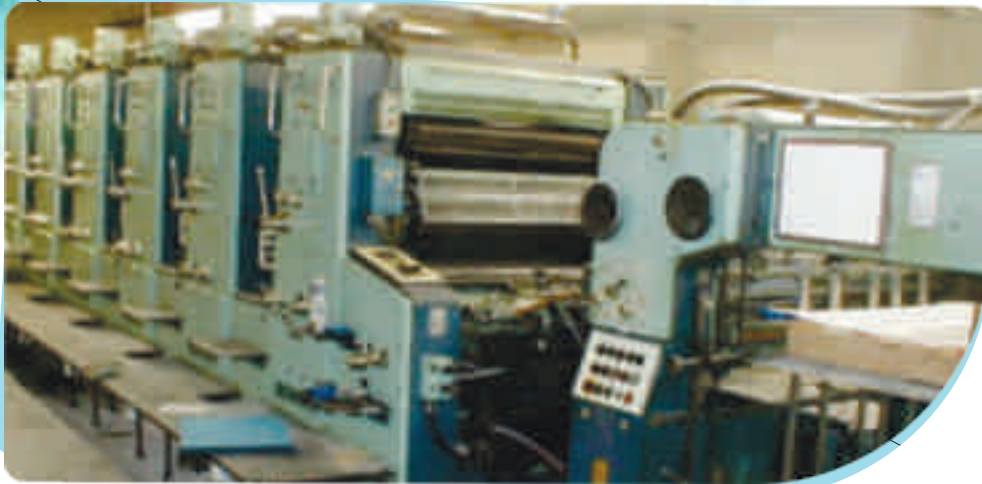
Offset Printing machine SUPER VERENT 5 colour Size - 820X 1030mm Capacity : 10000 Sheets per hr.